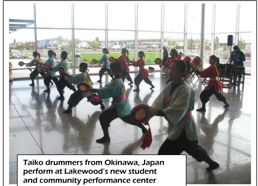
Taiko drummers from Okinawa, Japan perform at Lakewood's new student and community performance center at Clover Park Technical College in 2007.

As a member of Sister Cities International, Lakewood subscribes to an underlying principle that the world's peace and progress can be assured by people committing themselves to friendship and cooperation.