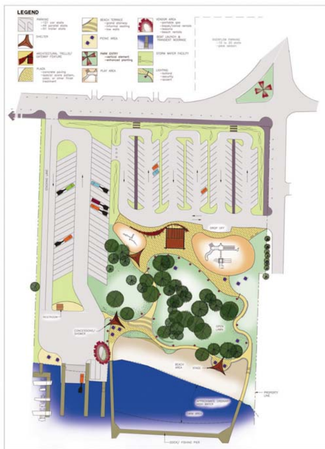
Preferred Option AMERICAN LAKE PARK MASTER PLAN City of Lakewood April 26, 2005

In January the City started working on a master site plan for American Lake Park. A series of open houses, public meetings and surveys were used to gather information and review alternatives. A master plan document was created which included many park improvements. The cost for all the master plan improvements is approximately $3 million. Staff is pursuing grants and other resources to fund a first phase which includes demolishing the structures on the west side of the park, rehabilitating the boat launch ramps and adding transient docks for boats and seaplanes, more vehicle/trailer parking and other amenities.