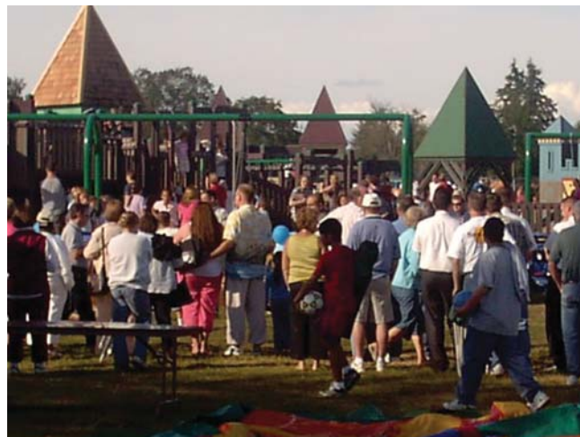
Hundreds of people attended the Grand Opening of the new playground at Fort Steilacoom Park during SummerFest 2005 on June 18.

However, recently, Keep Lakewood Beautiful has decided that it is time to become its own independent, nonprofit organization. The Council plans to continue working with them and encourages citizens to become Keep Lakewood Beautiful volunteers. For more information on Keep Lakewood beautiful see page 4.