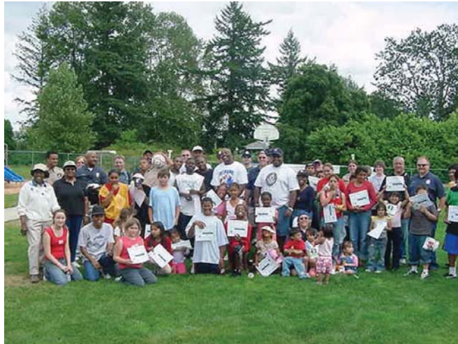
Participants had a great time at COPS on July 9 at Springbrook Park

Members of the Lakewood Police Department joined LAAPAC for a fun-filled day during Come Out and Play Sports (COPS) on July 9 at Springbrook Park. Approximately 50 kids participated in 3 on 3 basketball, soccer, volleyball, touch football and some table games such as dominos and chess. An afternoon of friendly competition came to a perfect conclusion for the kids when they tossed water balloons at the participating police officers.