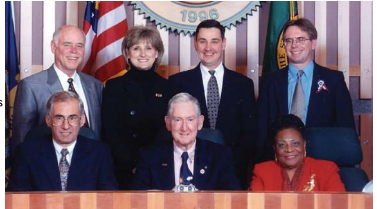
Lakewood City Council

Even since before Lakewood incorporated, Keep Lakewood Beautiful has been working to beautify our community. The landscaping and entry signs at