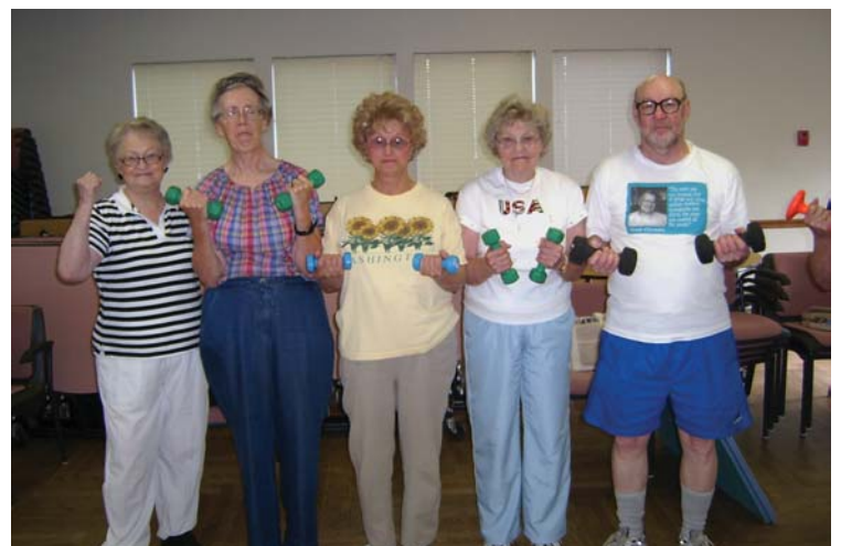
Members of the Lakewood Senior Center show off their muscles during a recent class.