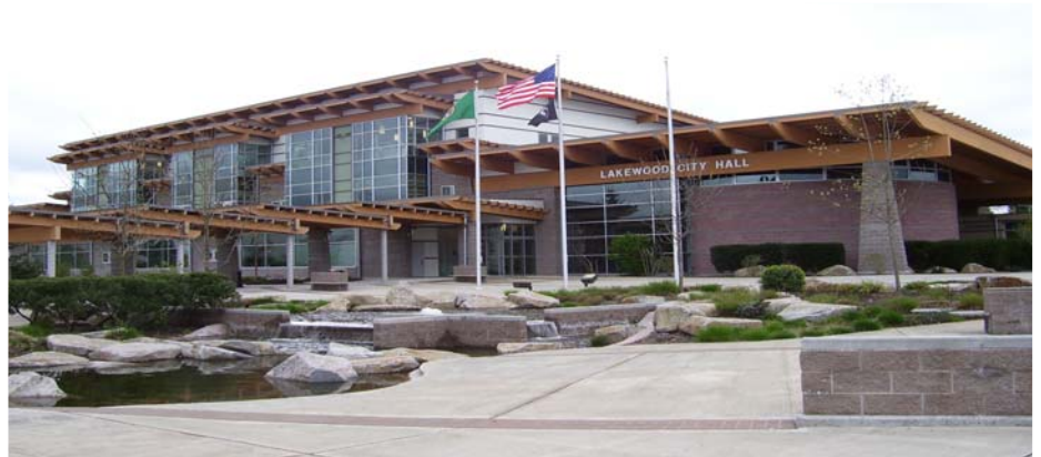
Lakewood City Hall