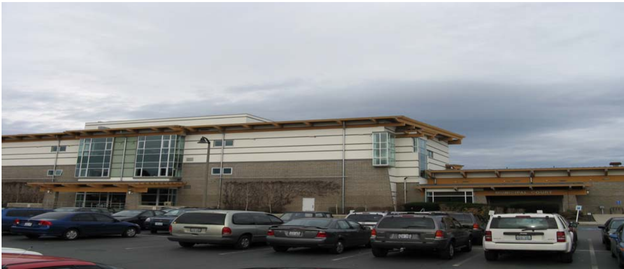
Lakewood City Hall, Southern Entrance

The Lakewood Municipal Court processed 7,568 infractions, 20,626 photo infractions, and 3,257 criminal cases in 2009 and conducted approximately 1200 – 1500 hearings a month.