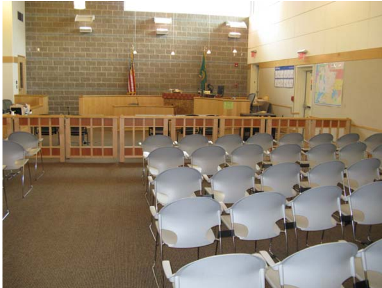
Lakewood Municipal Courtroom

The Municipal Court Services Director's salary range is $82,833 - $105,064 annually. A competitive benefits package includes options such as combination (vacation) and major medical leave, paid holidays, annual management leave and health benefits as well as an employer paid life insurance up to $100,000, optional employee paid pre-tax 457 deferred compensation plans, and other optional employee paid insurances. The City offers a social security replacement plan (ICMA 401A) and a qualified, defined contribution retirement plan (ICMA 401A).