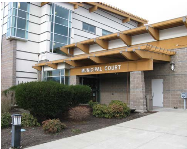
Municipal Court Entrance

Lakewood's economic development is both a high priority and a work in progress, especially along the Pacific Highway corridor adjacent to Interstate 5. The new Sound Transit Station is complete and part of a regional transportation system linked to the City's Towne Center. New commercial development along the corridor is already taking place, with a major new car dealer and hotel. In areas known for the challenges of low income demographics and social needs, new development is also taking place and the City is extending sewer service to both Tillicum and Woodbrook for the first time. The City's proximity to two major military bases is also a key factor in its economic development strategy. Lakewood is a young thriving community that offers its citizens a diverse, vibrant, and scenic place to call home.